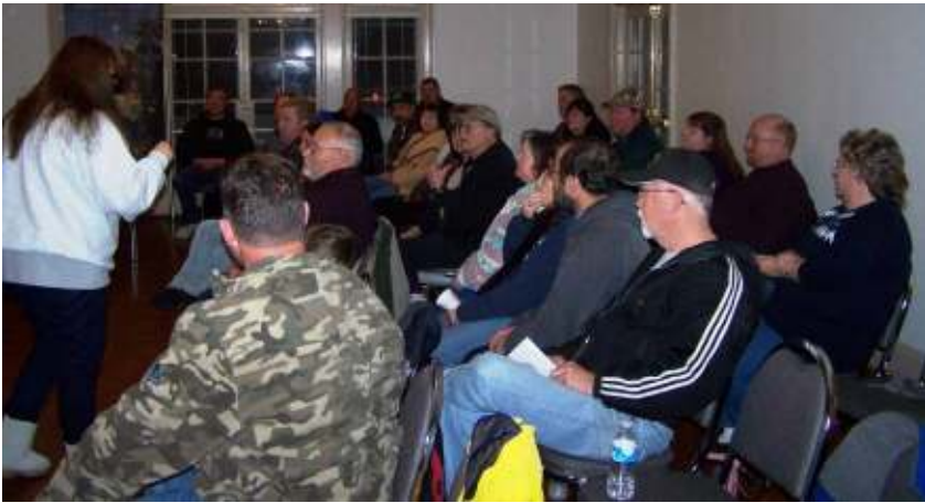
January Chapter meeting. After the meeting we had a white elephant gift exchange and raffle.