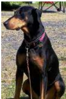
Club Mascot - Snoop