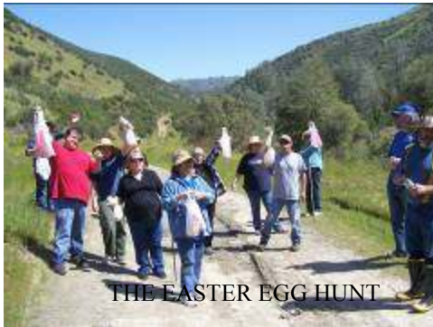
THE EASTER EGG HUNT