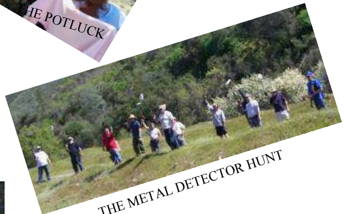
THE METAL DETECTOR HUNT