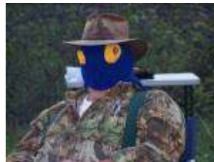
WHO LET IN THE ALIEN?