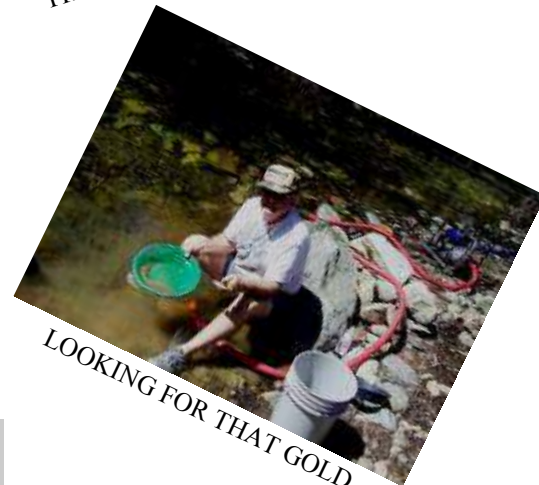
LOOKING FOR THAT GOLD

PUT UR TROUBLES IN A POCKET WITH A HOLE IN IT AND GO PROSPECTING