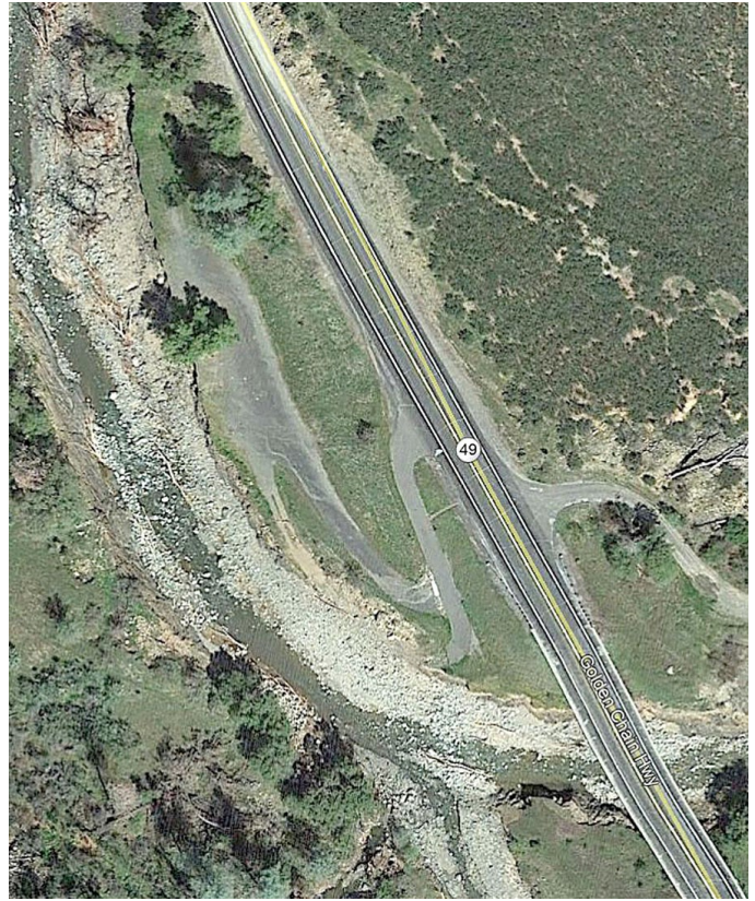
Moccasin Creek at Big Jackass Creek 2018

I was surprised to see how destructive the high flows had been. All the more distressing was the recent digging taking place in the newly eroded section of the parking area. It is obviously all fill material, judging from the slabs of concrete, from when they put the highway in. There is no gold in it. Please refrain from digging in it. If you see others digging in the eroded wall, please stop them before there is no parking at all. If you are digging down by the creek behind the wall, toss our rocks against it.