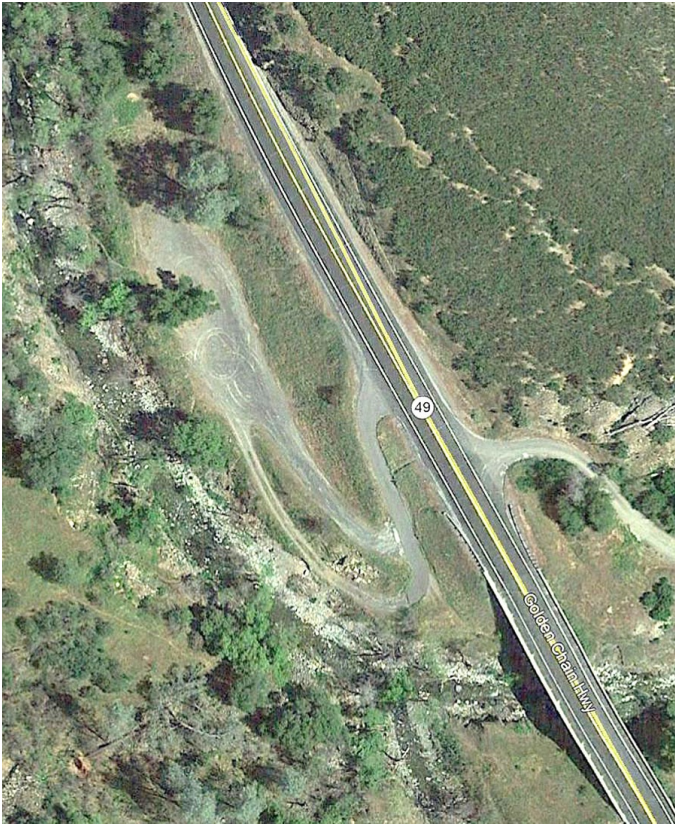
Moccasin Creek at Big Jackass Creek 2017

The Moccasin Creek claim was inaccessible to us for several months after this years heavy rainfall that washed out several sections of HWY 49. The highway is now open but the parking situation at the claim has changed. As you can see from the aerial photo, the creek is much wider after eroding the wall of fill material that made the large parking area. It is reduced by approximately 40%. The southern fork of the entry road is now a drop off just as it starts to curve around. I am not sure that a travel trailer can make it in and out any more. Before you take it up there, make sure to take a look at it first.