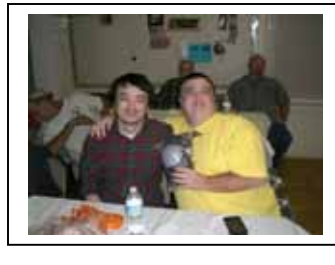
Cox Family Knee pads