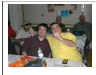
Cox Family Gold Nugget Winner