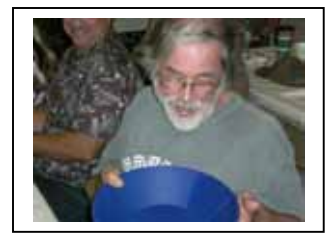
Lucky Winner Gold Pan