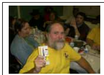
Stan Webster Tweezers w/vial