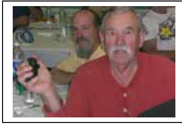
Ron Russell Black Sands magnet