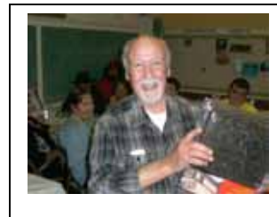
Glenn Frisbee Trailer Net