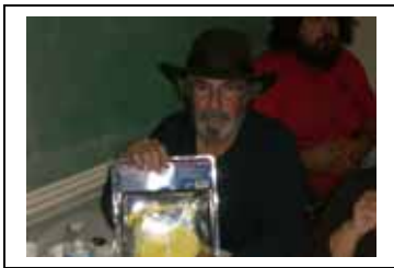
Kenny Nichols Tow Strap