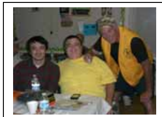
Cox Family Gold Nugget Winner