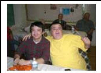
Cox family Crevice tool