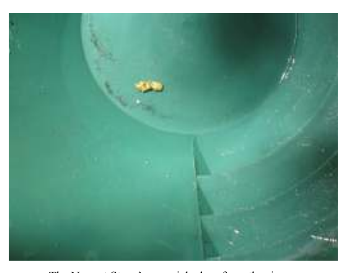
The Nugget Steve's son picked up from the river.