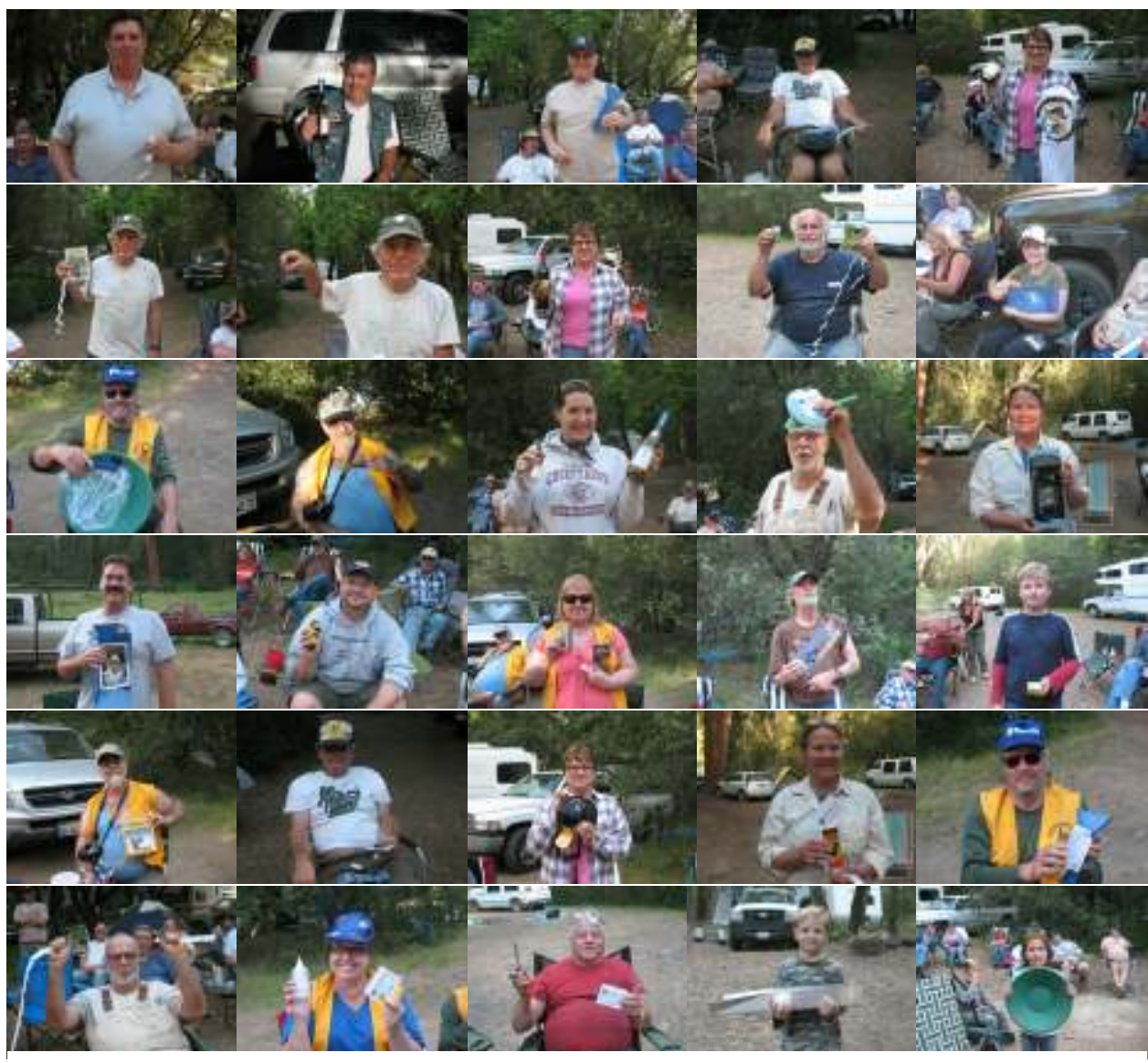
CONGRATULATIONS TO ALL THE WINNERS Thank you to everyone who supports the raffle and 50/50.